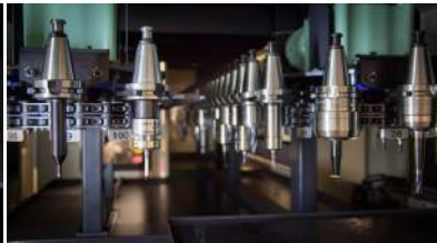
Automatic tool changers (ATC) with lots of tool capacity allows for efficient lights-out machining.